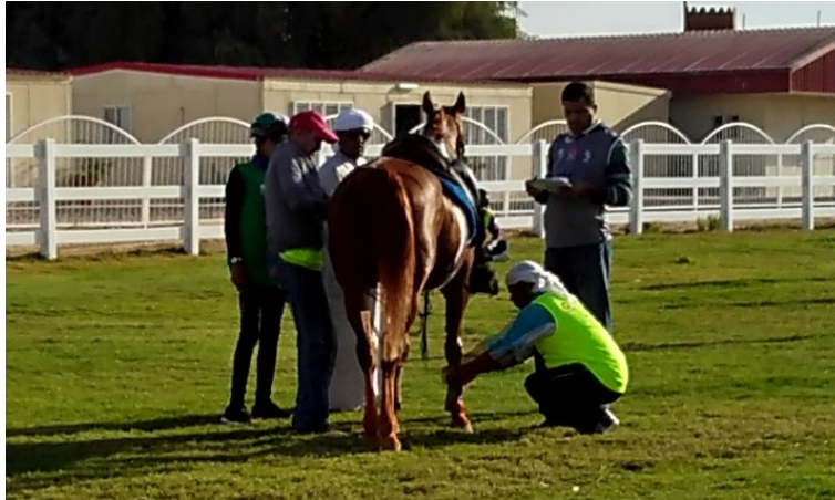
3. Check after the crossing of the finish line at the end of a phase.

There was also a disqualification because of insufficient weight. 8 kilos "only" were lacking. A trifle.