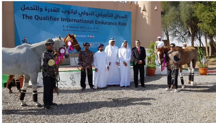
8. The first prize giving ceremony ... with everyone.

During the coming event, Boudheib Endurance plans to provide the horses with rugs bearing its colors to emphasize the new way.