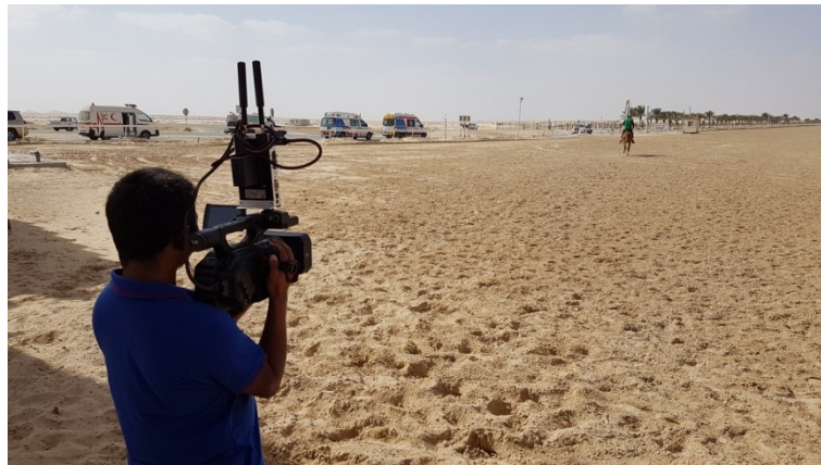
2. Live TV broadcasting through Internet.

"traditional" TV process which is heavier to handle, more expensive and has less geographical extent than what the Internet network easily provides. The rides of January 5 th and 6 th 2017 were a successful test of that mode.