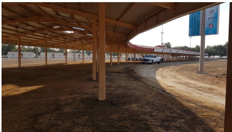
4. Vast shelters for the rest of horses during the hold times.

The shaded rest areas were enlarged as we mentioned in a former article.