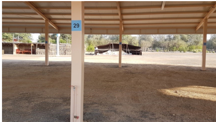
5. Numbered spaces to get a better distribution of the horses.

The first enforcement of this policy on January 5 th and 6 th was not exactly a full success. This is why during the events to come the stables will be assigned to numbered zones and will not have the possibility to choose where they wish to stay. This will lead to a better distribution.