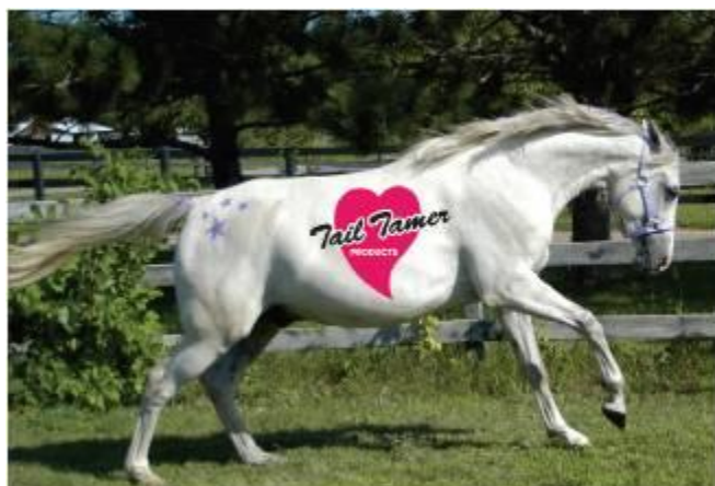
Lily Creek DaMoots (LC Diva Dance x *Dante)