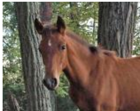
SA Jeeka's Jessica (Bayram x Oak Island Jeeka tb) at 4 months.