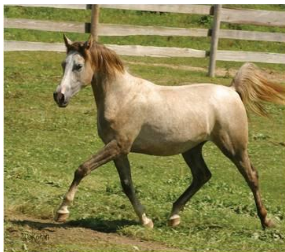
Lily Creek Dakota (Sarvar PFF x Dynamo’s Dancer)