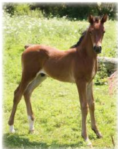
Lily Creek Magnum

I wish to say thank you-- to all of the people, many new breeders, who purchased my horses. They are already making an impact in their new homes. I still have a few horses for sale and all of them are from my best bloodlines. Special prices on the two weanlings!