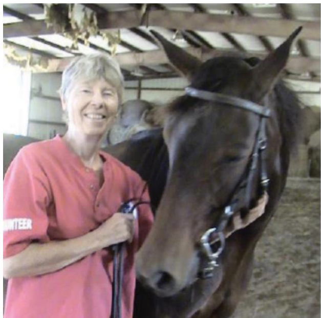
Romany (Bayram x Sabaskanova ox)