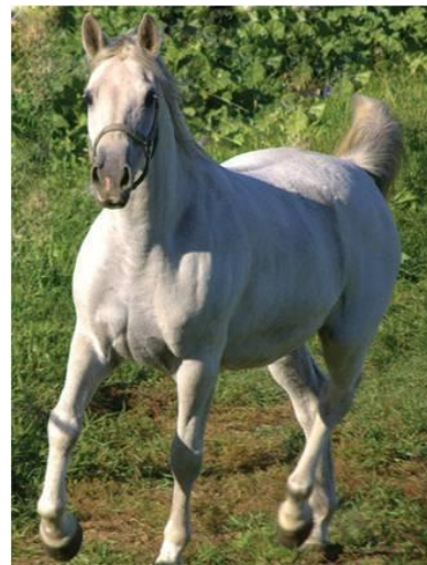
Dancin' and Stetson are half siblings Both are sired by SARVAR PFF If Stetson had not been injured he was scheduled for the Fort Valley ride Dancin' placed in.