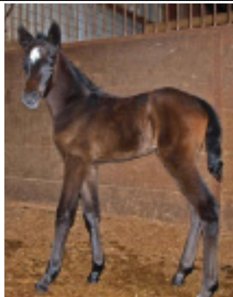
SA Elita (Bayram x SA Enif ox)