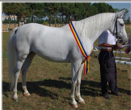
Shaganah (Shagan x Shagya LVI-29)

The winner of the 2009 Shagya Championship was the stallion Shagya LXII (right) and second became the wonderful mare Shaganah (left), actually she was my personal favorite and winner.