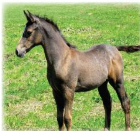
Lily Creek DanceWithMe

Lily Creek Tiarra, is a coming six year old Hunter type mare, ready for the Hunter or combined trainer barn. She can be seen at Buckland Farm, Haymarket, Va. 16.3, big boned, very athletic and suitable for a timid rider. No vices, no blemishes and you will love her kind, sweet temperament. Dam is Anglo Trakehner, TUNIS. LC Stetson is her sire.