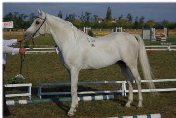
Shagya LXII (Shagya LVI x 219 Koheilan XXIX-11)