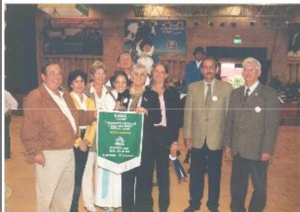
Exitos Raza Shagya Árabe en la Agroexpo 2005, Haras la Hungaria & Haras La Irlanda