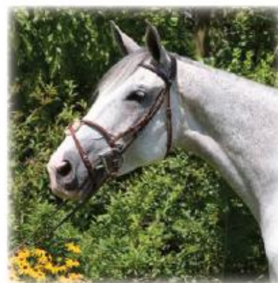
Lily Creek Tiarra

Lily Creek Tiarra, is a coming six year old Hunter type mare, ready for the Hunter or combined trainer barn. She can be seen at Buckland Farm, Haymarket, Va. 16.3, big boned, very athletic and suitable for a timid rider. No vices, no blemishes and you will love her kind, sweet temperament. Dam is Anglo Trakehner, TUNIS. LC Stetson is her sire.